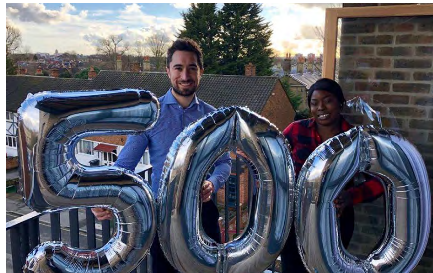
Lewisham Council has just approved our 500th Council Home

to council-owned housing blocks, prioritising those buildings with vulnerable residents. At the same time, we've campaigned for funding from the Government for both the current programme and future extensions.