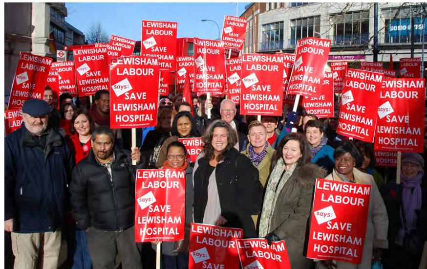
The Tories tried to close our A&E, Labour and the community fought back and won

campaign, taking the Government to court and keeping Lewisham A&E and maternity services open.