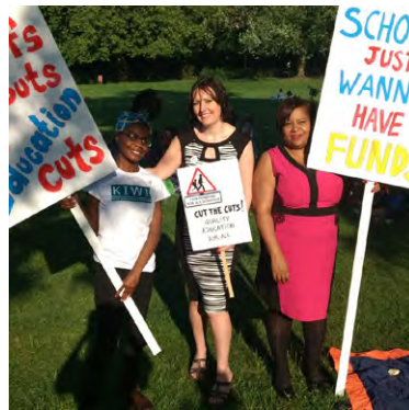
Labour are fighting back against Tory cuts to our schools

We need to improve our primary and secondary schools, and we need to ensure that all young people have the opportunity to continue learning after school and build a fulfilling career. We will continue to give the highest priority to our children and family services, and we need to ensure all our young people – no matter what their background or challenges – achieve their potential and thrive.