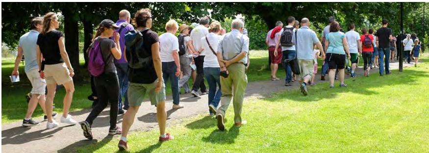
Local residents and Labour members enjoying the Lewisham 3 Peaks Challenge

Human-made global warming is the greatest single threat facing our planet. We have a duty to protect our environment and our planet for our children and for future generations. This means that we need to cut carbon emissions, reduce waste and pollution, and ensure we limit the impact of our actions on the environment.