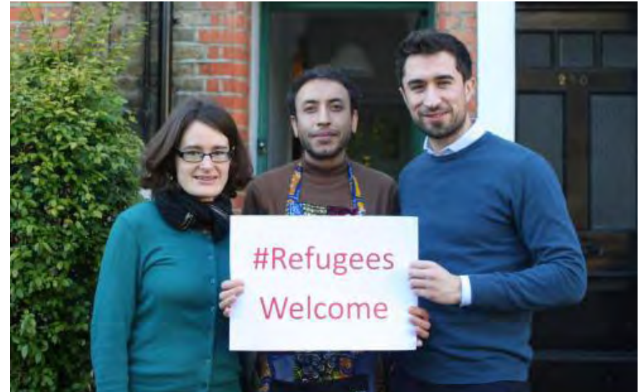
Lewisham has welcomed refugee families fleeing persecution

We value Lewisham's unique diversity and cultural heritage. We will continue to be a borough that shows that communities work best when we come together.