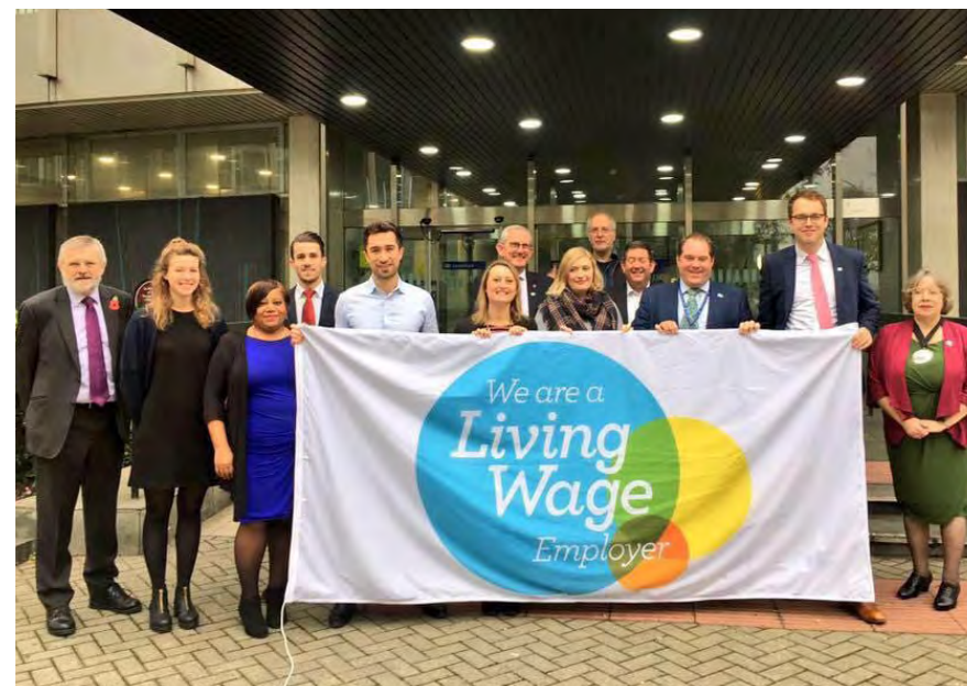
Lewisham was the first Living Wage Council in the country