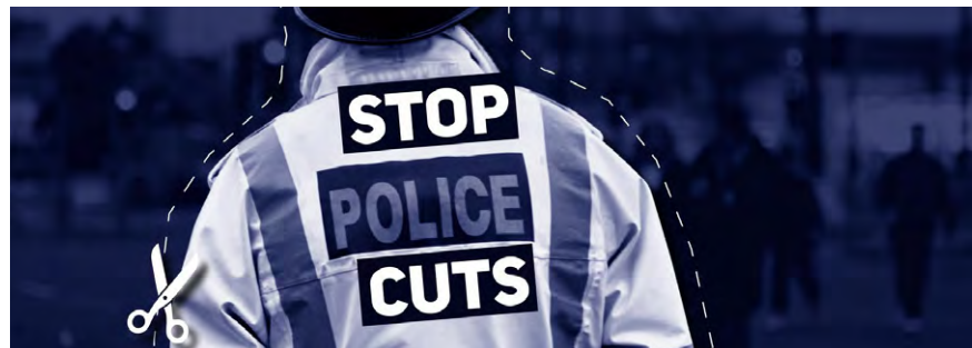
The Tories have cut £700 million from policing in London

Labour believes British policing is at its best when it is rooted in local communities, when it is visible and when it is trusted. We want to bring the police and our community closer together to