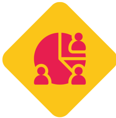
Supported by population health data