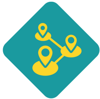
Common to our nine places

Prior to the Coronavirus Pandemic, we engaged extensively across our partnership to understand the key health and wellbeing issues that are;