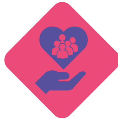
Relevant to the Long Term Plan

We wanted to understand the big issues we need to address to improve health and reverse the widening gaps in life expectancy between the poorest and wealthiest in our population. Stroke, suicide, alcohol related harm and death from violent crime were all identified for targeted whole system action, together with better access to services (eg cancer) in deprived communities.