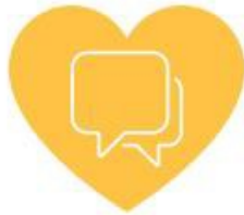
Valuing one another

The behaviours we expect to see at LPT are: