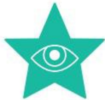
Taking personal responsibility